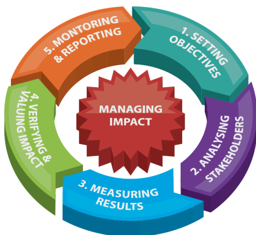
Figure 1: The impact management process